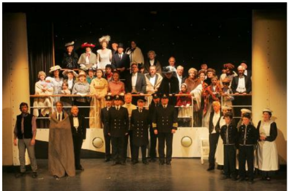
The company aboard Titanic

I have also enjoyed singing a solo in most of the Music Hall and Show Stoppers shows until 2017, my first one being in May 1987.