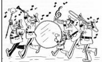
Jo's cover design for The Music Man in 1980